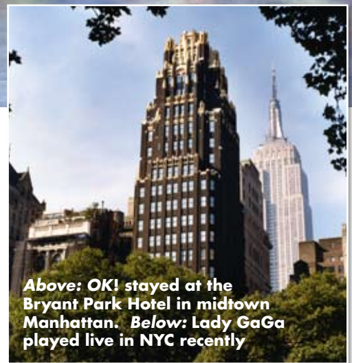
Above: OK! stayed at the Bryant Park Hotel in midtown Manhattan. Below: Lady GaGa played live in NYC recently

The hotel's vaulted Cellar Bar is a popular haunt with the fashion pack, while the Japanese fusion restaurant Koi, all dark woods and orchids, is also the place to be seen. Kelly Osborne and Nicole Ritchie have both been spotted here.